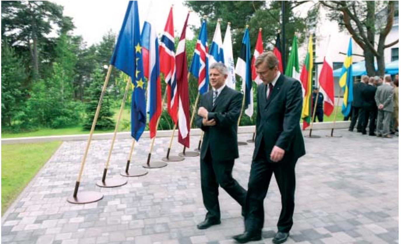
Marek Belka, Prime Minister of Poland, rolled up his sleeves as Poland took over the CBSS Presidency from Estonia at the Laulasmaa summit on 21 June. To his right is Juhan Parts, Prime Minister of Estonia.