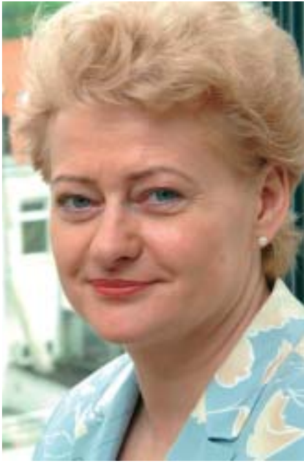
Dalia Grybauskaitė is Lithuania's first European Commissioner, responsible for financial programming and budget.

tions, but it is a very important part, and it is a field in which the CBSS has a very important role to play.