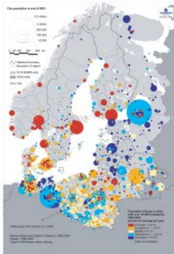
Figure 3: Population change in BSR cities 1995–2001

In BSR Russia, Kaliningrad is the only major town not losing population. In ab-