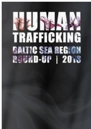
Human Trafficking, Baltic Sea Region Round-Up 2016