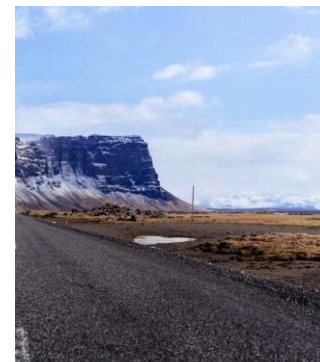
The Baltic Sea Region methodology for risk and capability assessments, a first approach