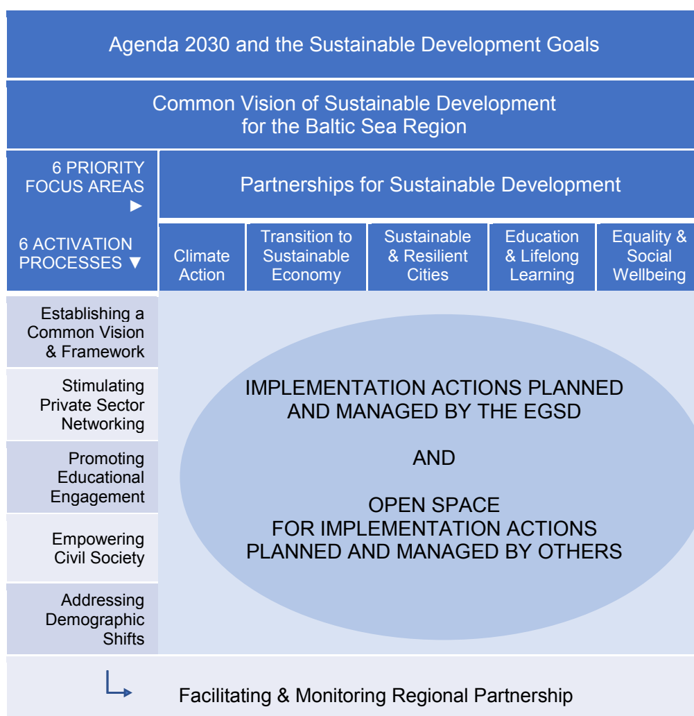
Table 1: Initial planning matrix and Implementation Framework for the Baltic 2030 Action Plan